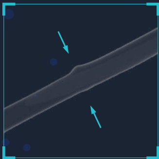
Low-profile: 2. 58Fr(0.86mm)