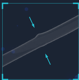
Low-profile: 2. 67Fr(0.89mm)